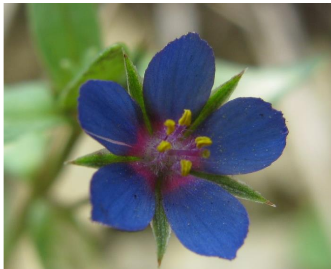
Lysimachia foemina at Lytes Cary (2011).