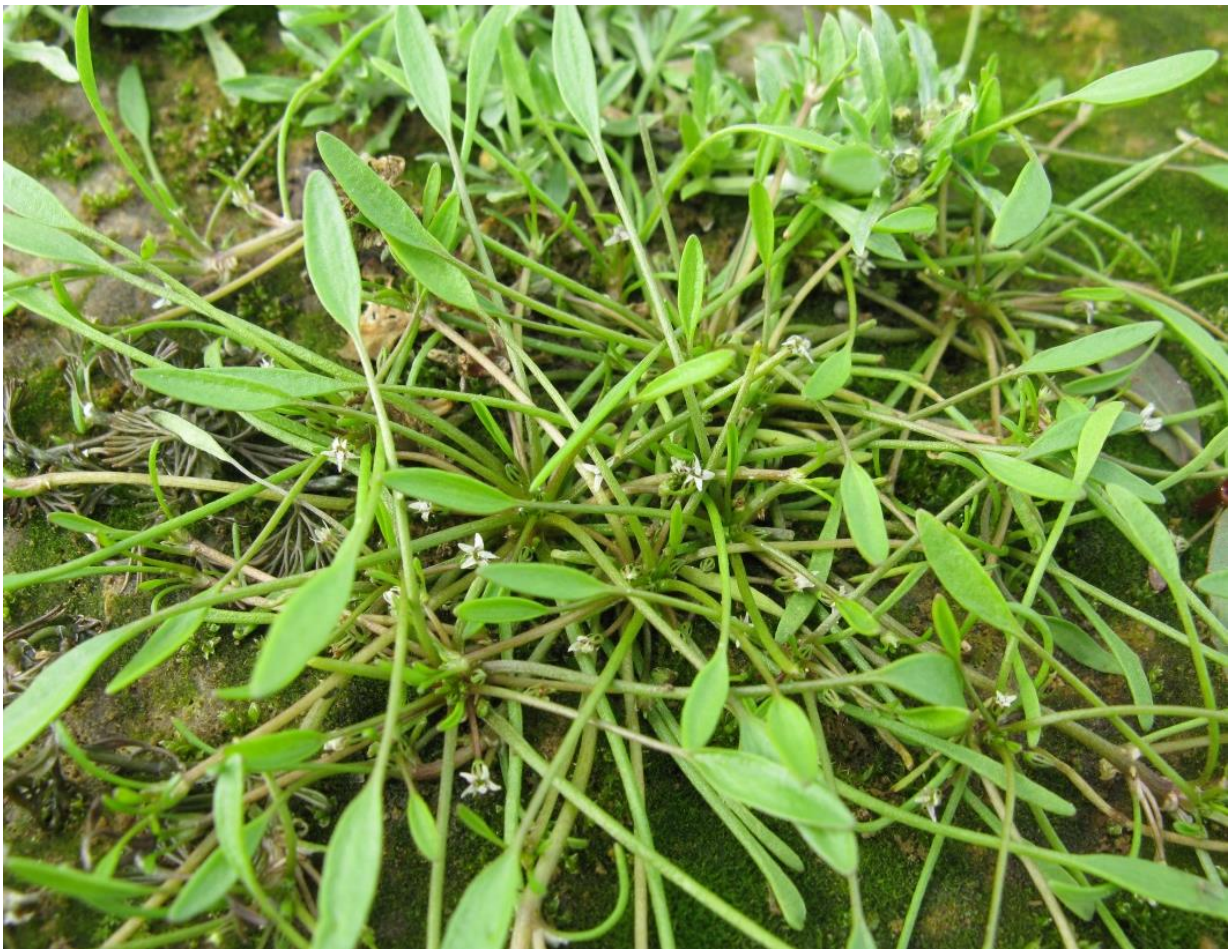
Limosella aquatica at Chew Valley Lake (2011).