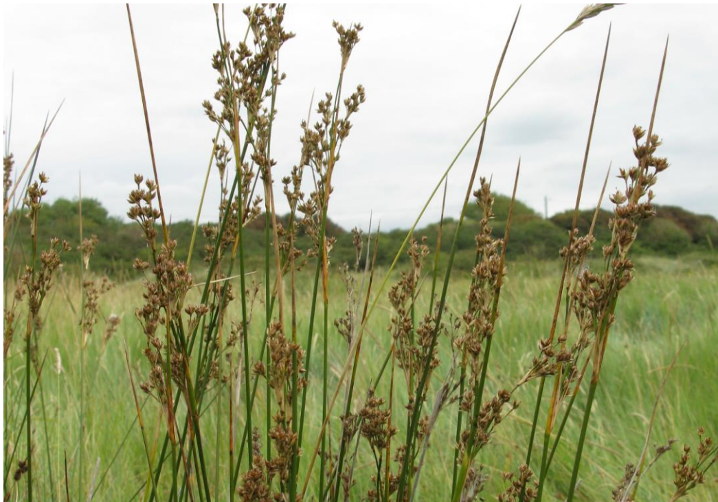
Juncus maritimus at Sand Bay (2011).