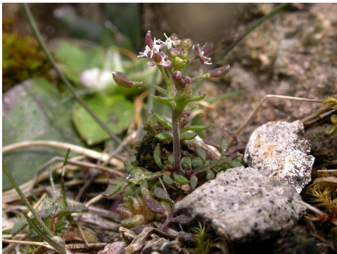
Hornungia petraea at Ubley Warren (2007).