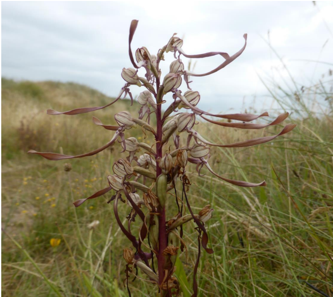
Himantoglossum hircinum at Berrow Dunes (2008).