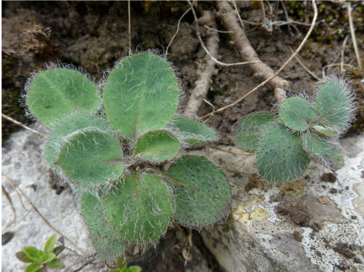
Hieracium schmidtii on S-facing side of Cheddar Gorge (2016).

It is still to be found in Cheddar Gorge, although certainly not "in fair abundance": only 12 plants were found during the Cheddar Rare Plant Survey in 2016, with usually only a single tiny rosette at each location (Crouch, 2016). The species has clearly declined in Somerset and indeed does not occur anywhere in quantity (McCosh & Rich, 2011). It has a very scattered distribution and since 2000 has only been recorded in Somerset and the Outer Hebrides. Records at Cheddar Gorge are the only records for England since before 1960.