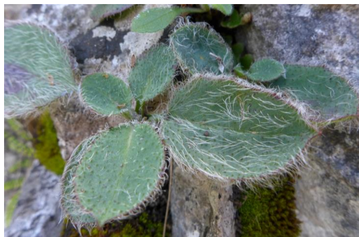
Hieracium schmidtii on S-facing side of Cheddar Gorge (2016).