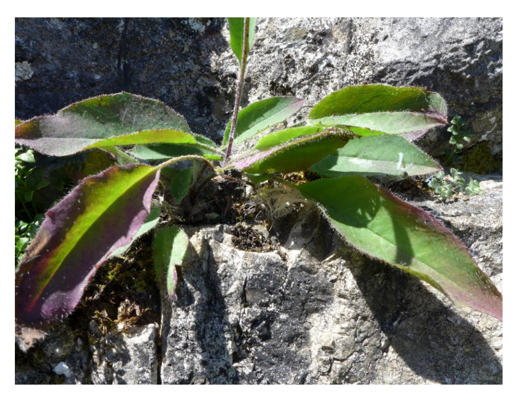
Hieracium angustisquamum at Ubley Warren (2016).