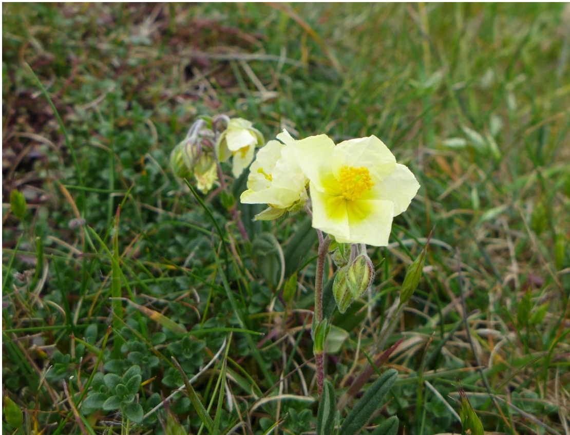
Helianthemum x sulphureum at Brean Down (2017).