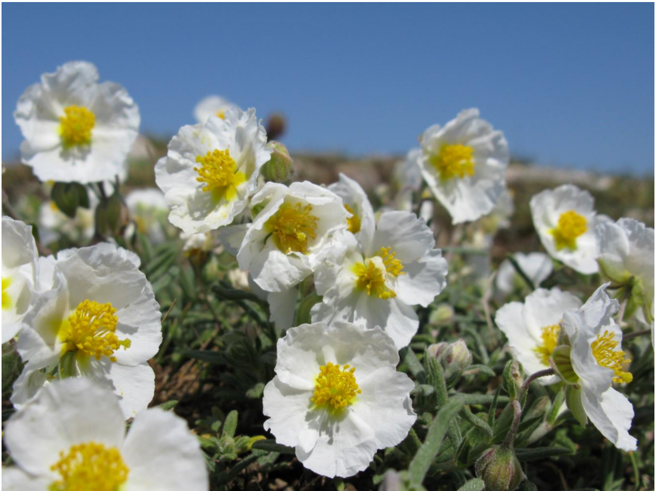
Helianthemum apenninum on Brean Down (2011).