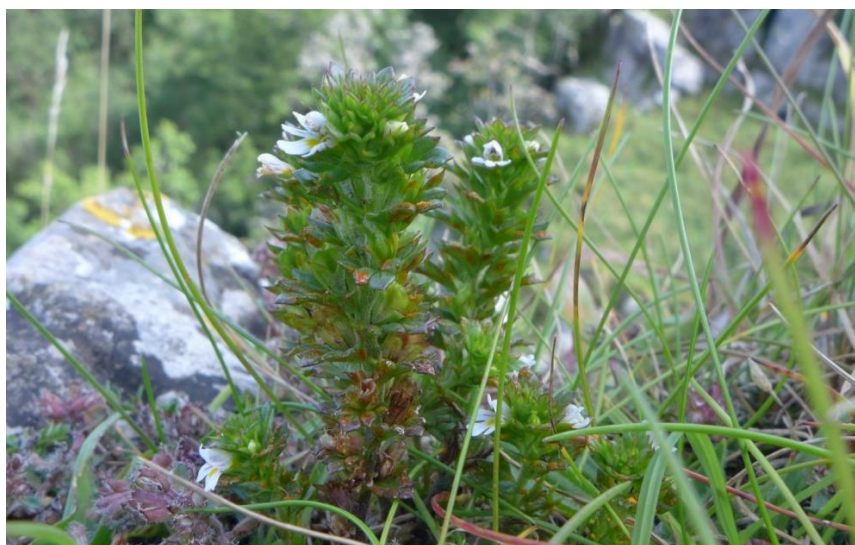
Euphrasia tetraquetra at Cheddar Gorge (2017).