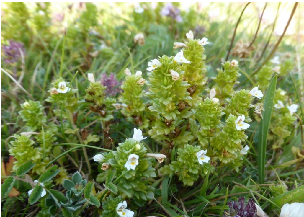
Euphrasia tetraquetra on Brean Down (2014).