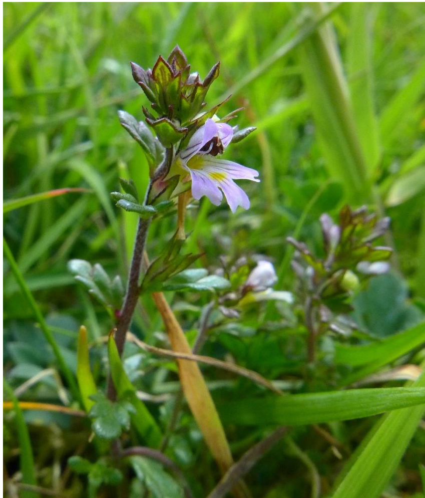
Euphrasia confusa x micrantha at Withypool Common (2015).

Resembling an erect rigid E. confusa with fewer basal branches, longer lower internodes and darker leaves, this hybrid is found in grassland and heathland, on roadsides, banks and coastal turf (Stace et al. , 2015). In Somerset E. micrantha has only ever been found on Exmoor (VC5), and not since 1987; this hybrid is also restricted to Exmoor, but has been recorded more recently than its rarer parent. The earliest record is a specimen in BM collected by E.S. Marshall at Simonsbath in 1918 (det. P.F. Yeo). In 1982, Alan Silverside recorded this hybrid at three sites on Exmoor: on a heathery roadside bank on Winsford Hill (SS8634), on a moorland roadside bank at Comer's Gate, Withypool (SS861353) and, in the absence of both parents, on a road bank north of Lanacre Farm, Lanacre (SS861353) (A.J. Silverside, 1987, letter to R.B.G. Roe). In 2010, specimens collected at Weir Water Valley were identified as this hybrid by Alan Silverside, and in 2015 several plants, identified by Chris Metherell, were found on a roadside bank at Withypool Common. In 2017, Graham Lavender found a population on a roadside at Yenworthy, amongst a swarm of other Euphrasia plants. This hybrid is known to persist and form uniform and attractive populations in areas from which E. micrantha appears to have gone (Stace et al. , 2015); this would appear to be the situation in Somerset.