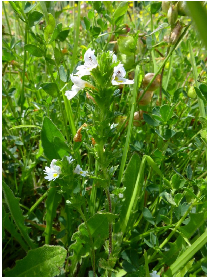
Euphrasia arctica x nemorosa at Langridge (2014).

This hybrid most closely resembles E. nemorosa , but has larger flowers and broader floral leaves with the short glandular hairs of its other parent. It is believed to be widespread in Britain and Ireland (Sell & Murrell, 2009). In VC5 it was unknown until found by Graham Lavender in 2015 at County Gate, at the western edge of the Somerset, the specimens determined by Chris Metherell. It has since been found at Smalla Combe, Culbone Hill, North Common and Yenworthy Farm, all in the same area of Exmoor; on rides or verge in Monkham Wood and Druid's Combe Wood in the Brendons; and on cliffs at Blue Anchor Bay and Warren Bay. In VC6 first recorded by Miss Roper (as E. nemorosa x borealis ), who found it with the parents in rough pasture on Failand (White, 1912); there were then no records for a century. Since 2012 this hybrid has been found at Stockhill, Priddy Mineries and Ubley Warren on Mendip, in a field at Langridge to the north of Bath and in grassland by a disused quarry at Downhead, all identifications confirmed by Chris Metherell. As one of the commoner hybrids, this is likely to be more frequent than records suggest.