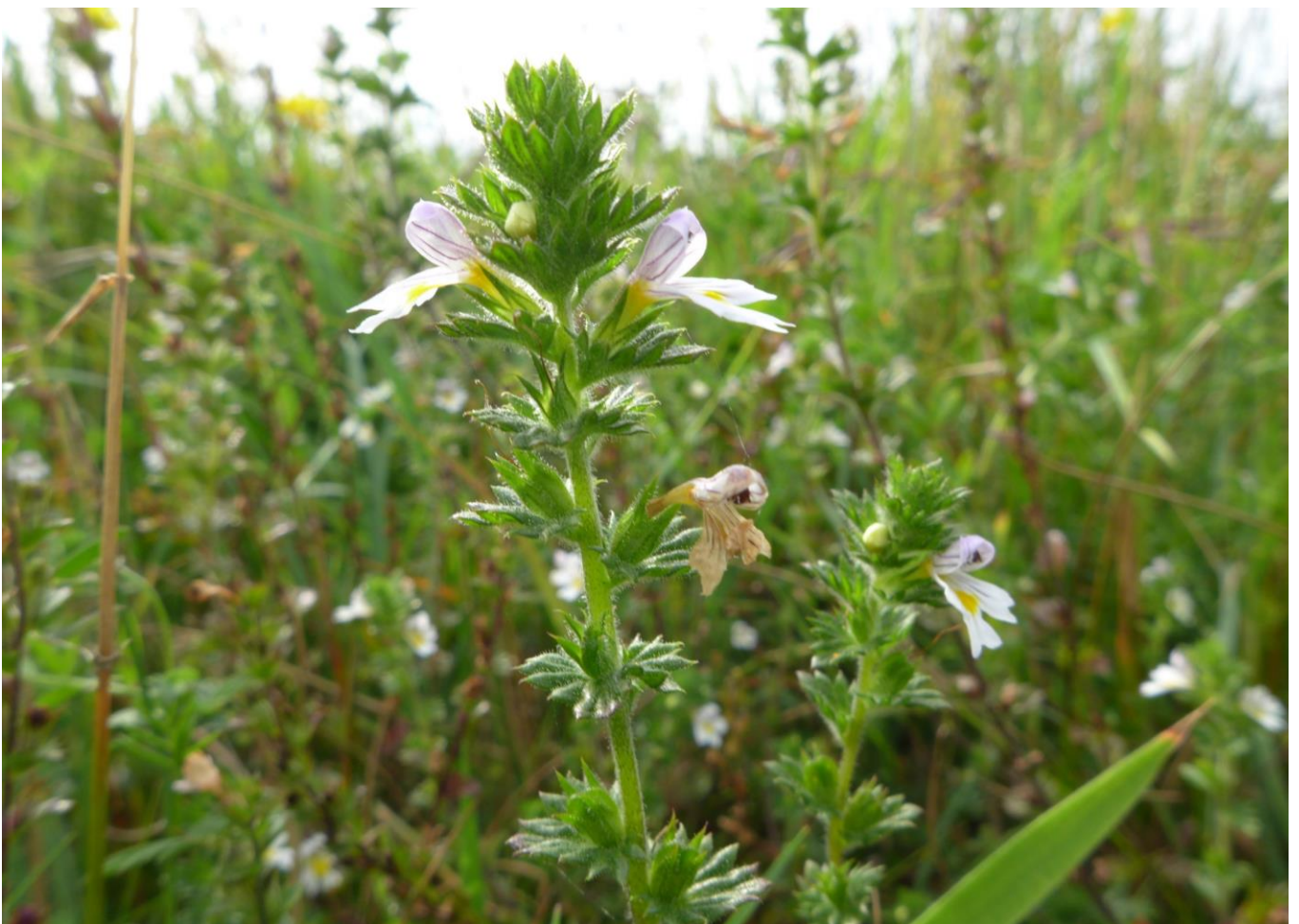
Euphrasia anglica x arctica at Ashcott Plot (2017).

An annual, hemiparasitic, tall, robust, large-flowered hybrid with the stature of hay-meadow variants of E. arctica but bearing long flexuose glandular hairs. In VC5 this hybrid was found for the first time in 2016 by Graham Lavender, at Goat Hill on Exmoor, growing with both parents, the specimens determined by Chris Metherell. In 2017 it was also collected from Aclands, just south of Goat Hill. In VC6 a specimen in BM collected in 1903 from Shapwick was determined as this hybrid by P.F. Yeo. A specimen in CGE collected by H.S. Thompson from the " Carex evoluta enclosure" in 1922 was also determined as this hybrid (then E. anglica x brevipila ) by P.F. Yeo, as was a specimen in K collected by V.S. Summerhayes in 1928 at Sharpham, in low peaty pasture. Both these last two were believed to have come from Sharpham Moor Plot (Yeo, 1956). Further plants were found in moderately long grass in a relatively acid spot at nearby Street Heath (Yeo, 1956). There were no subsequent records until 2011 when this hybrid was collected in a hay meadow beside Ashcott Plot, the identification confirmed by Chris Metherell. This is a rare hybrid: outside Somerset it is known at three sites in Devon, there is an old record from Kirkcudbrightshire, and in 2018 this hybrid was found new to Ireland, in North Tipperary.