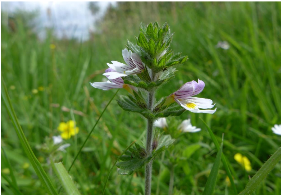
Euphrasia anglica near Totty Pot, Cheddar Gorge (2016).