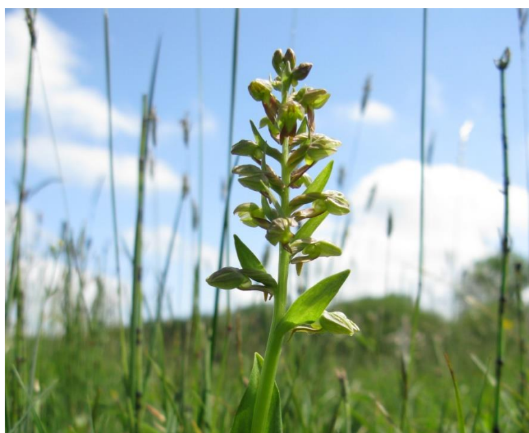
Coeloglossum viride at Canada Farm, Shapwick Heath (2012).