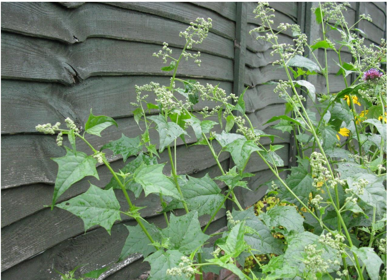
Chenopodiastrum hybridum in Bath (2012).