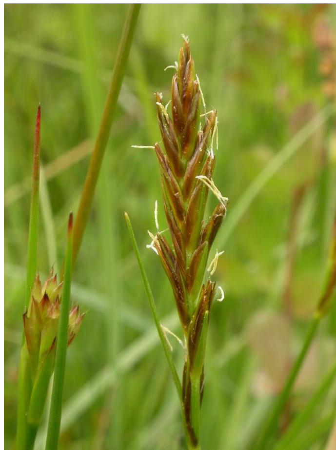
Blysmus compressus at Windsor Hill Marsh (2007).