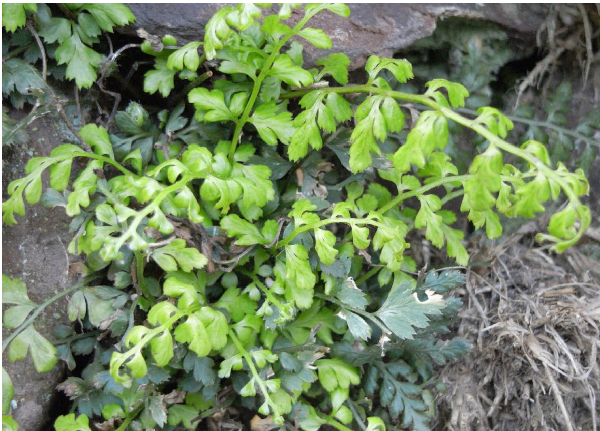
Asplenium obovatum at Porlock Hill (2009).