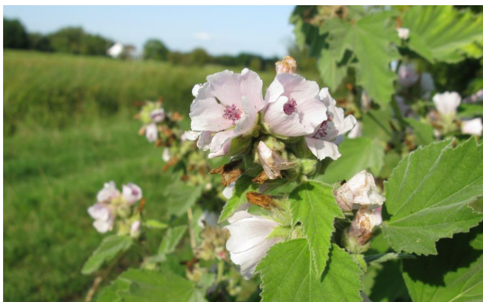
Althaea officinalis at Southlake Moor (2010).