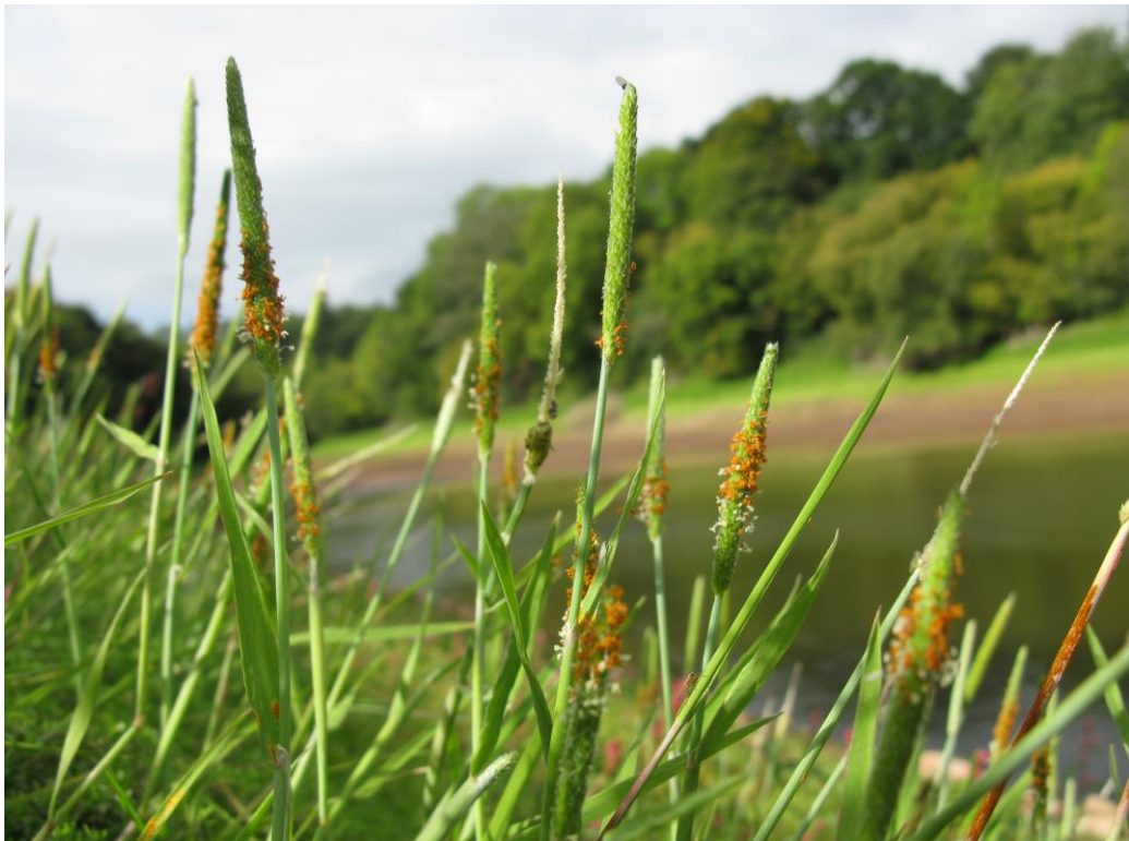
Alopecurus aequalis at Hawkrigde Reservoir (2011).