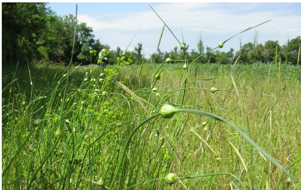
Allium oleraceum at Lytes Cary (2012).