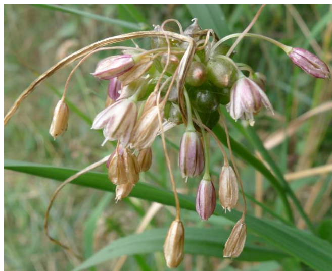
Allium oleraceum at Pill (2012).