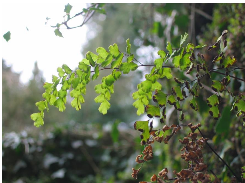
Adiantum capillus-veneris at Batheaston (2008).