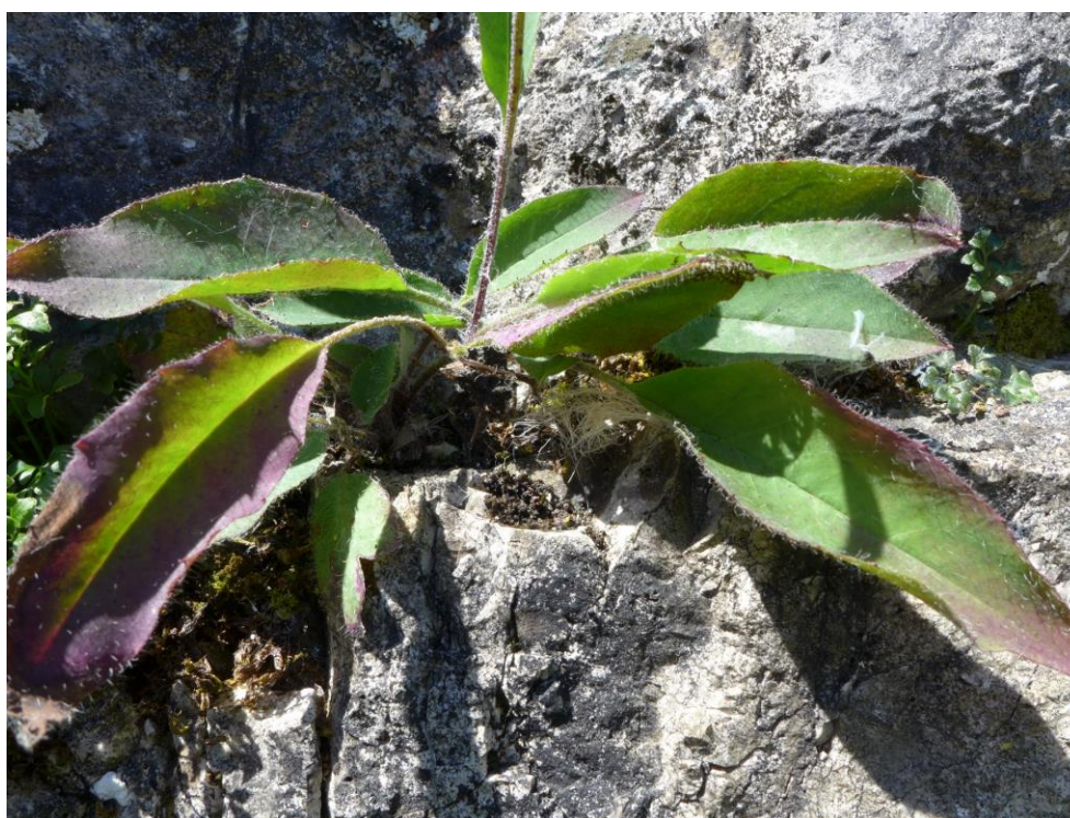
Hieracium angustisquamum at Ubley Warren (2016).