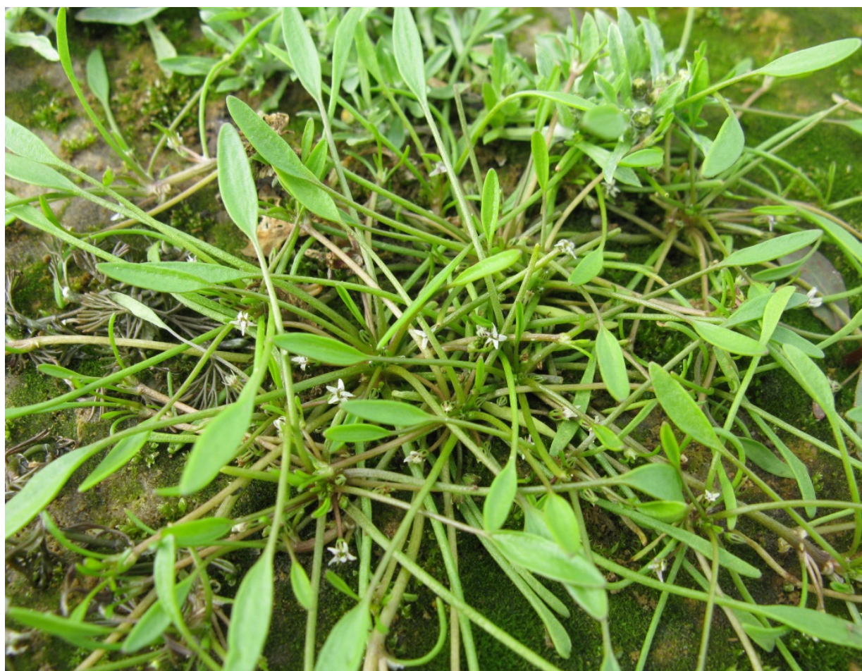
Limosella aquatica at Chew Valley Lake (2011).